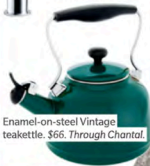
Enamel-on-steel Vintage teakettle. $66. Through Chantal.