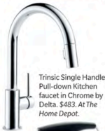
Trinsic Single Handle Pull-down Kitchen faucet in Chrome by Delta. $483. At The Home Depot.