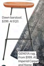
Dawn barstool. $299. At EQ3.